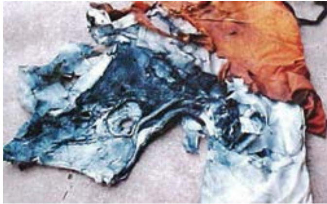
There are large holes penetrating this body armor material, which has burned and shrunk away from hot fragments from a bounding mine. The material had a NATO STANAG 2920 V50 in excess of 450 m/s.

they strike by melting or burning it. It is true that much of the kinetic energy in any projectile is converted to heat when it is obliged to stop rapidly, but some fragments generated by mines and explosive ordnance start off hot, a fact that makes some PPE materials shrink away from them.