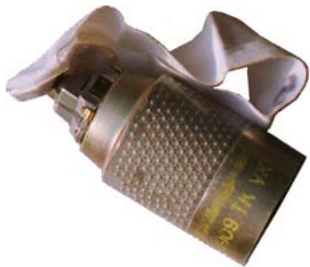
KB1 submission.

There have been improvements to demining PPE over the past twenty years, but most have been incremental. One example is