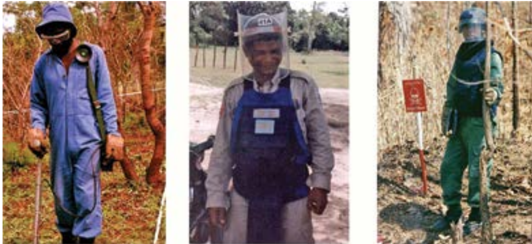
Left to right, the images show demining PPE used in Mozambique and Cambodia in 1997. 11

providers insist that the minimum level of PPE required in the IMAS is used, which implies that the IMAS level of PPE is broadly accepted as being reasonable , but PPE is only the final protective measure after all other reasonable means of managing risk have been taken.