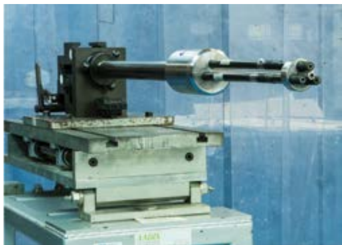
The image shows the RMA’s triple fragment launcher for testing PPE with near-simultaneous strikes.

The requirements of the IMAS published in 2001 went some way to level that playing field but did not bring standards up to those used in civil EOD work in Europe and the United States, because those drafting the IMAS, including the author, deemed that impractical. However, if we could reduce the number of deminer injuries and/or the severity of their injuries, it is an obligation for any humanitarian organization to do so because we must do “everything reasonable” to manage and reduce risk of injury to our employees. So the current risk is only tolerable if we can show that we have done everything reasonable to manage and mitigate risk and show that we have done this in a way that would satisfy a court of law. Some international demining insurance