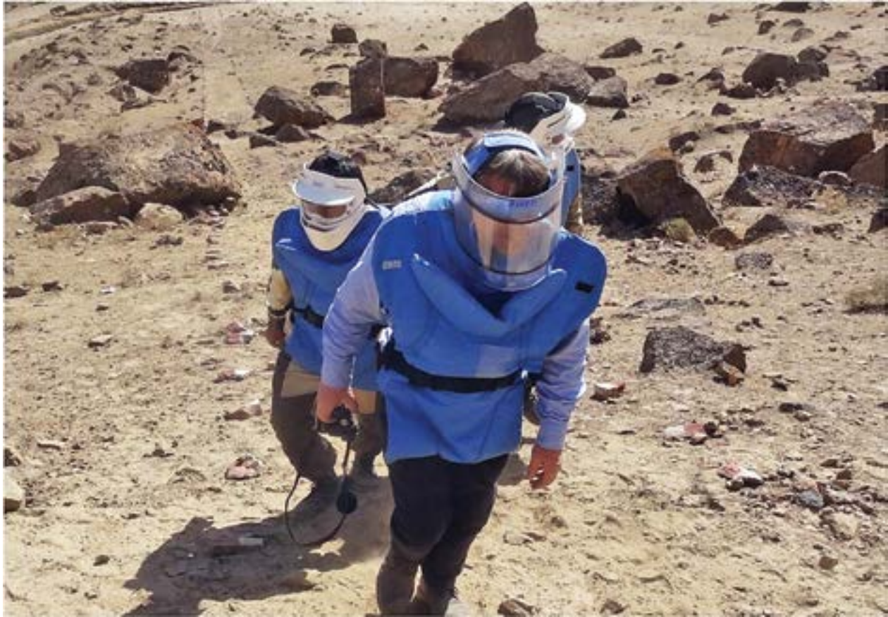
Smith (front) wearing the most commonly used demining PPE in Tajikistan in 2016 - the deminers behind are wearing the ROFI mask.

ROFI demining face mask) would be worthwhile. This armor need not be able to protect against rifle fire (often approaching 1,000 m/s), but any increase to comfort and affordability in deminer protection would be an improvement.