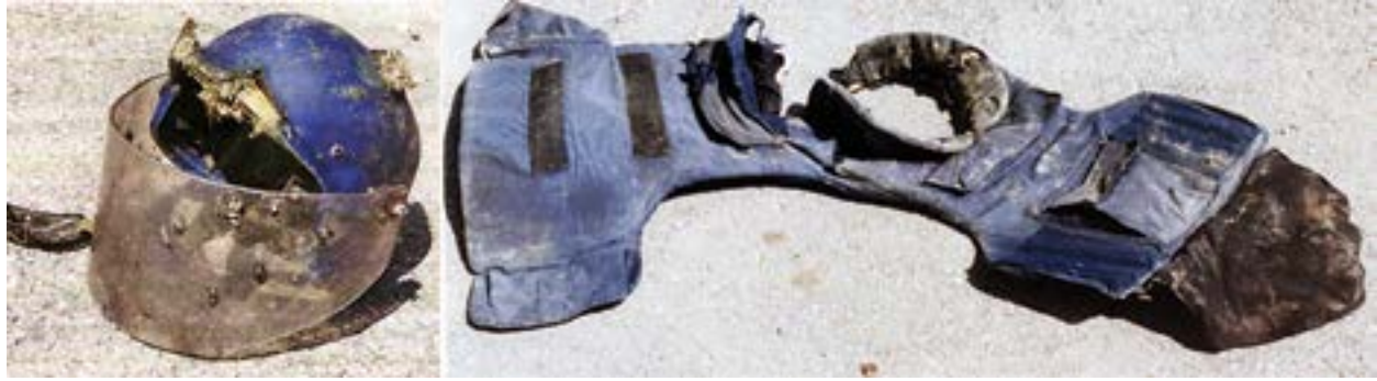
The images show combat body armor with a V50 of 450 m/s and a helmet after being struck by fragments from a PROM-1 bounding fragmentation mine. The deminer suffered multiple penetrations to torso, arms, and head and bled out rapidly.

effective transparent visor material that could match the protection of body armor is not available, so this is not possible.