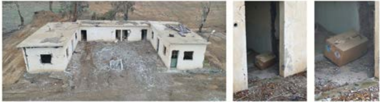
Images from a small unmanned aircraft (SUA) show the extent of structural damage, then close-up views of visible suspicious items.