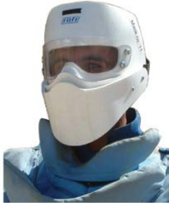
The images show the lighter blast visor and the ROFI face mask. 5,6

the availability of lighter body armor materials with a tighter weave that allows higher levels of protection to be achieved in a garment of the same weight, or more of the wearer to be covered without a weight increase. The design of a lighter visor and some improved hand tools have also been incremental improvements. 3 The ROFI demining face mask is the only truly novel advance because it makes use of a very lightweight laminate named PURE, but its design has been criticized and it is not widely used. 4